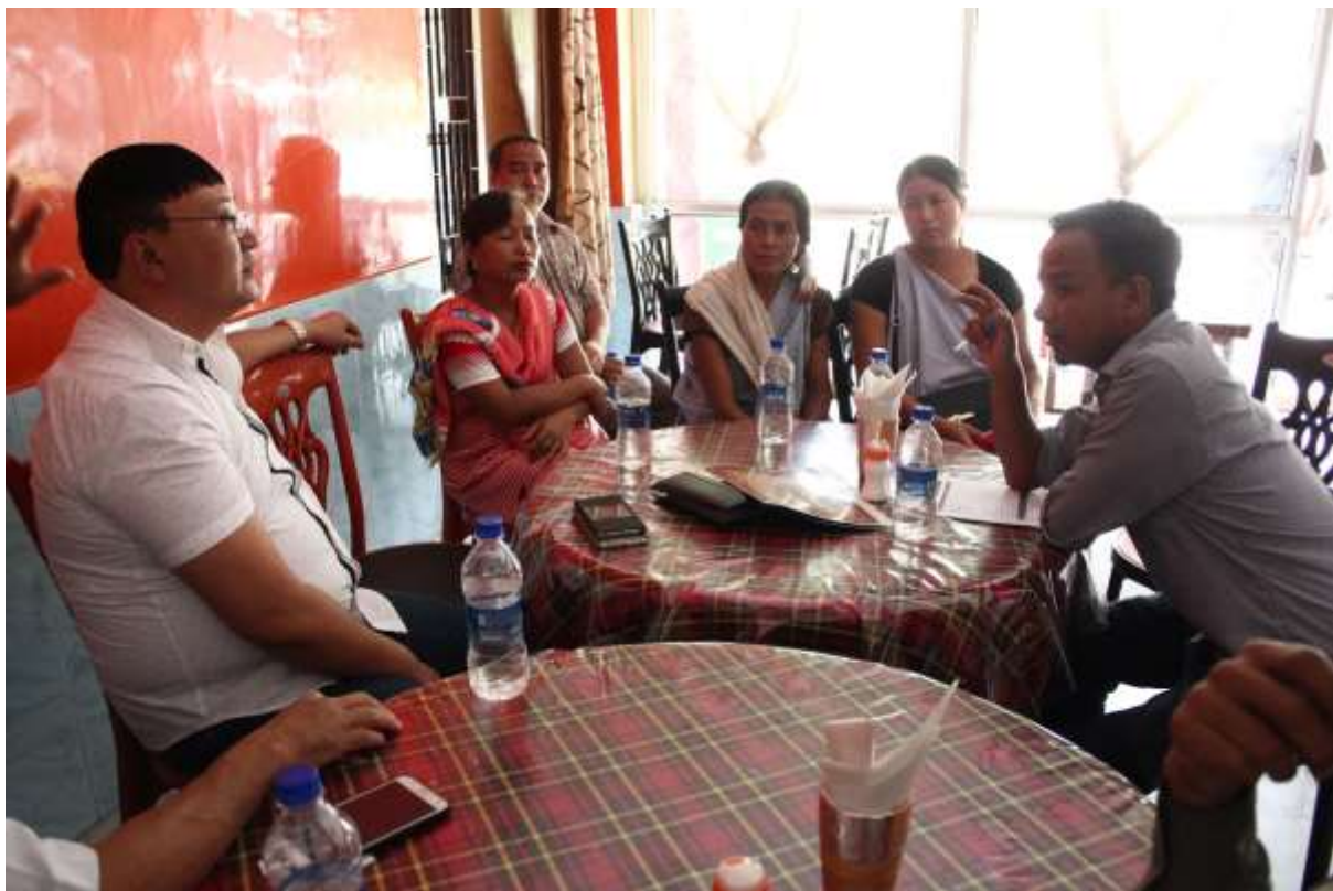
Figure 3 Consultation with Land Owner and former Land Owners on 29th May, 2017

The project site allocated for setting up of entry point is located in 19th Mile, Pahammawlein which falls under Umling Community and Rural Development Block in Ri Bhoi District. The distance from Umling toll plaza to 19th Mile is 1 Km and 14.5 km from the district Headquarter that is Nongpoh.