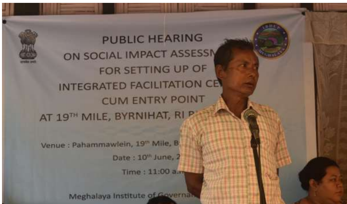
Figure 8 Public Hearing at 19th Mile, Ri Bhoi District on 10th June, 2017