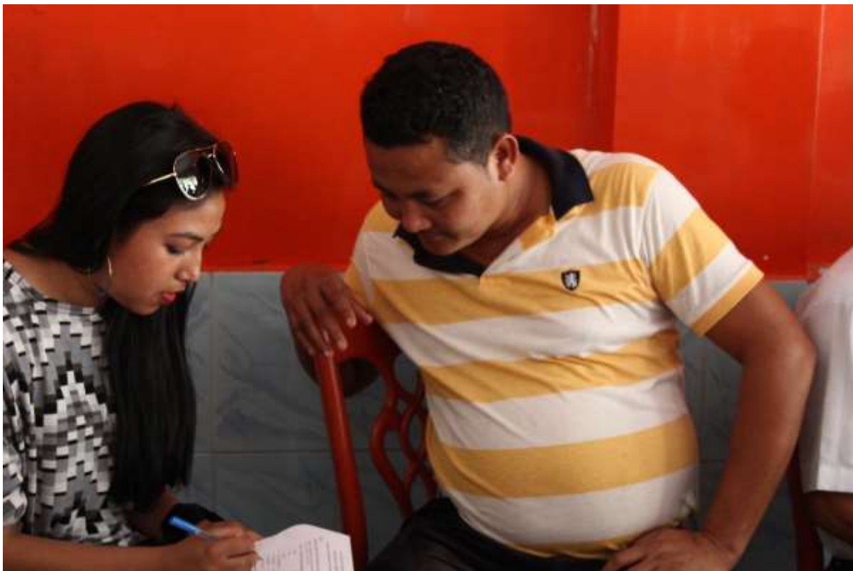
Figure 4 KII with member of the Village Durbar

the new land owner it has been left unused. The adjacent land owner still goes and collects the broomsticks until now.