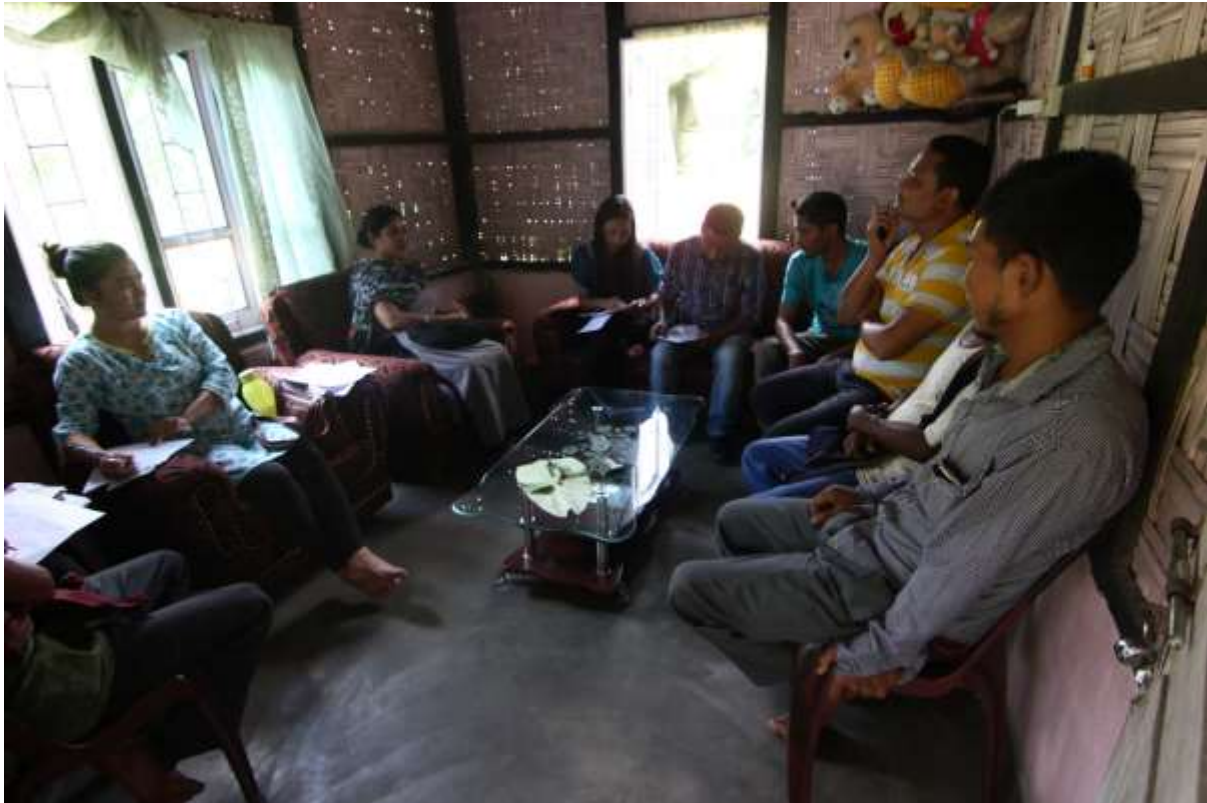
Figure 5 FGD with village residents on the 5th June, 2017