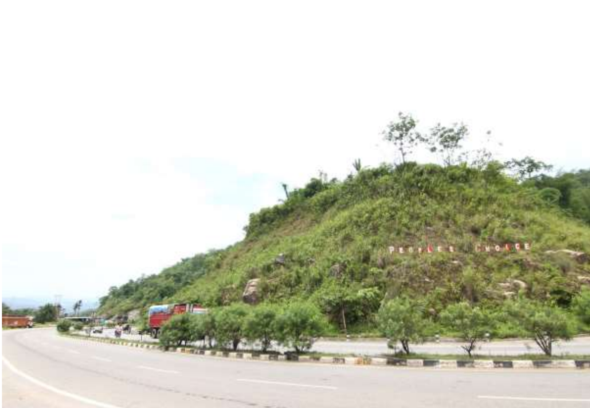
Figure 1 Project Site

The main objective for the proposed Integrated Facilitation Centre at the Entry point is to prevent and check the influx of the illegal entry into the State. It will facilitate the entry of the people from outside the state.