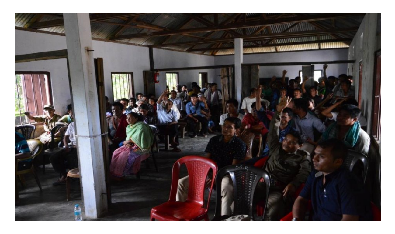
Picture 4: Showing the approval of the community members from Maliodr and Ratacherra.