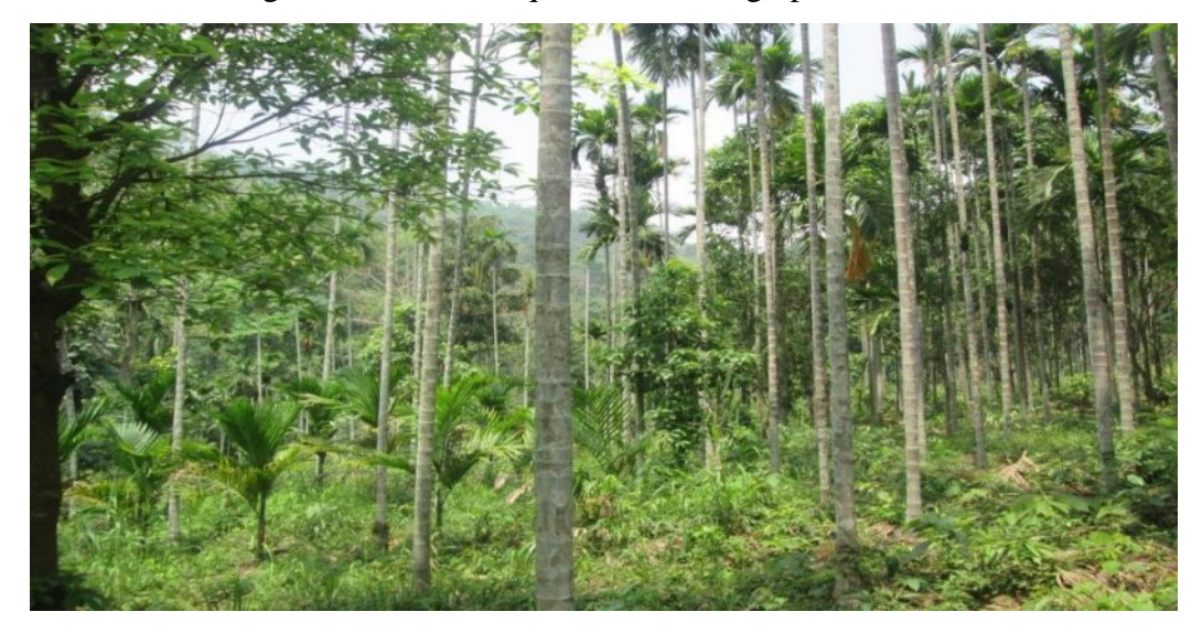
Picture 1 and 2: Showing the land to be acquired for setting up of the Facilitation Centre.