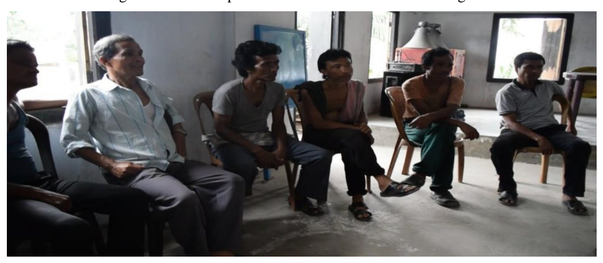
Picture 6: Showing the Focus Group Discussion held at Ratacherra village.