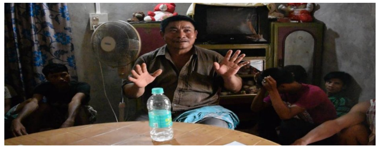
Picture 5: Showing the Focus Group Discussion held at Malidor village.