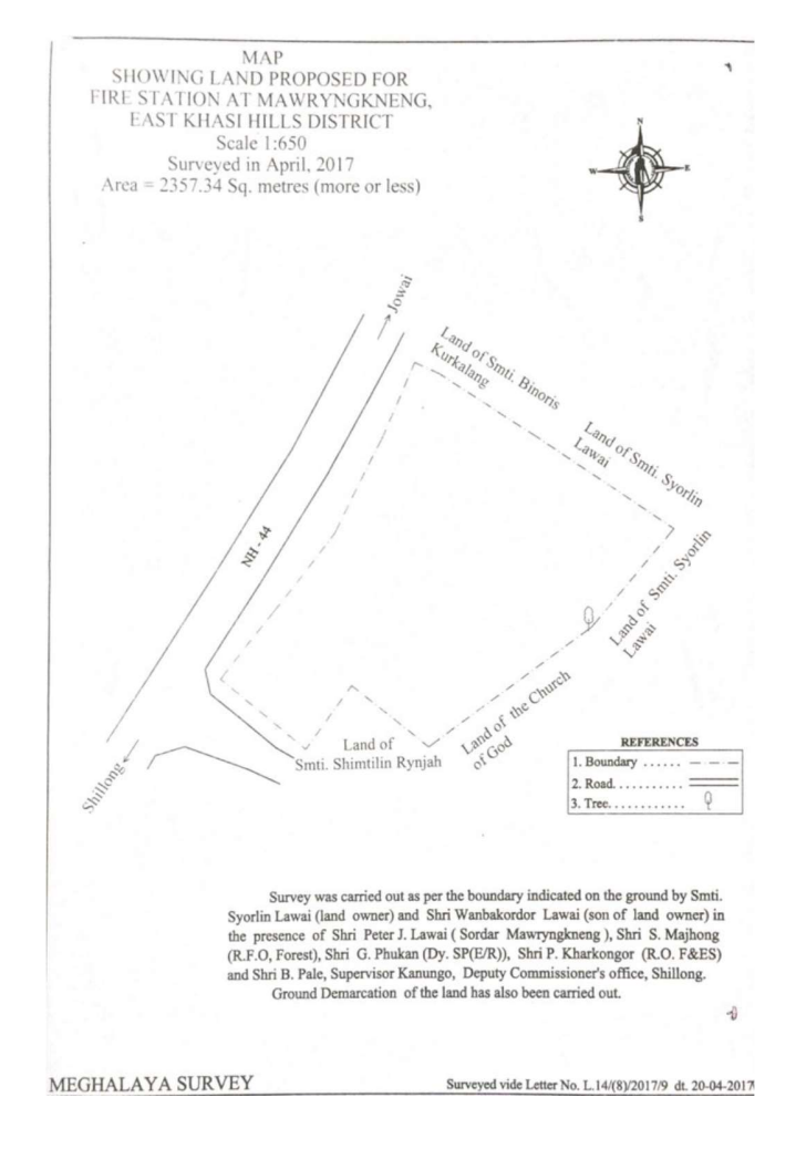
Figure 2 Map of Proposed Project Site

The proposed land has been acquired with the intention to set up a Fire Station in Mawryngkneng, East Khasi Hills District.