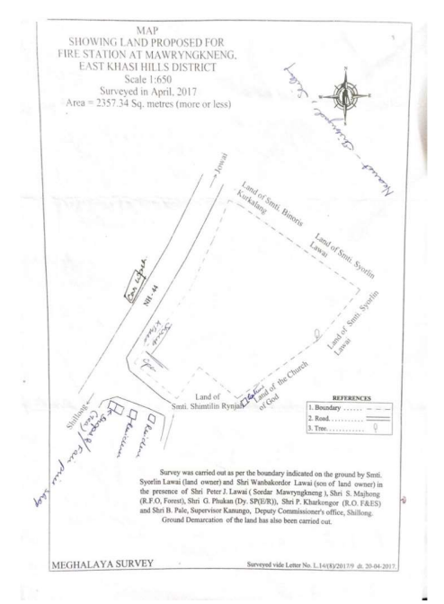
Figure 3 Map showing Project site with nearby structures as observed during Preliminary site visit

The proposed project site belongs to one individual Smt. S. Lawai who is a farmer. The proposed project site is located along NH 44 and is arable land which is no longer cultivated on. On the south western side of the plot is a road leading to a church belonging to the Church of God.