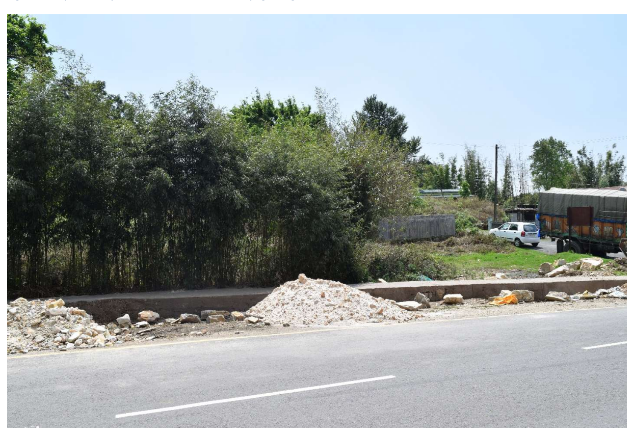
Figure 1 Proposed Project Site at Pomlahier, Mawryngkneng

The project proposal includes the construction of a Fire Service Station at Mawryngkneng. The proposed project area measures an area of 2357.34 Sq. meters. The land to be acquired is located along NH 44 which connects Shillong and Jowai. The Mawryngkneng Fire Station would serve not just Mawryngkneng village, but the other villages under Mawryngkneng C&RD Block in times of road accidents, natural calamities, fire, etc.