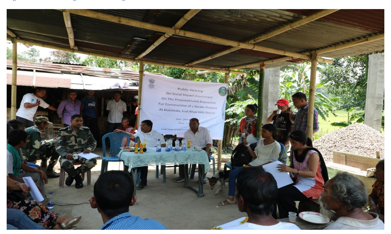
Figure 6 Public hearing at Dholai Village.

After reading the report, the community members of Dholai Malai said that they have no objection to the proposed land acquisition in their village. They believe the setting up of Border Outpost in the area will further improve the safety and security of the area and the state as a whole.