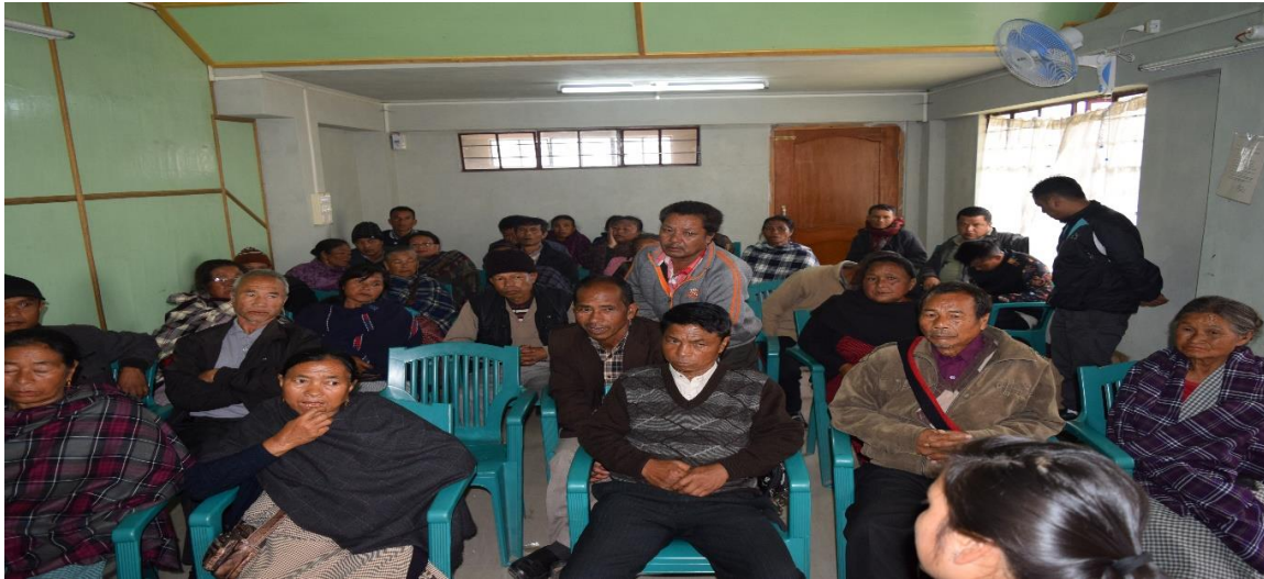
Figure 3 Community discussion for additional land acquisition of NH 44E

The following are the discussions, opinions, views and perceptions made by the community members from the project affected villages.