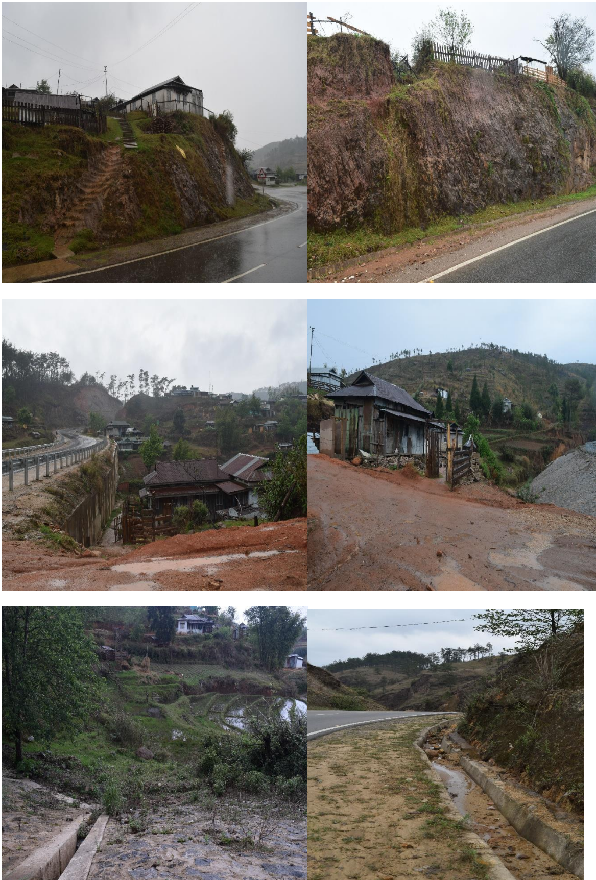
Figure 4 Shows the concern of soil-run off and mud slide into agricultural and residential area