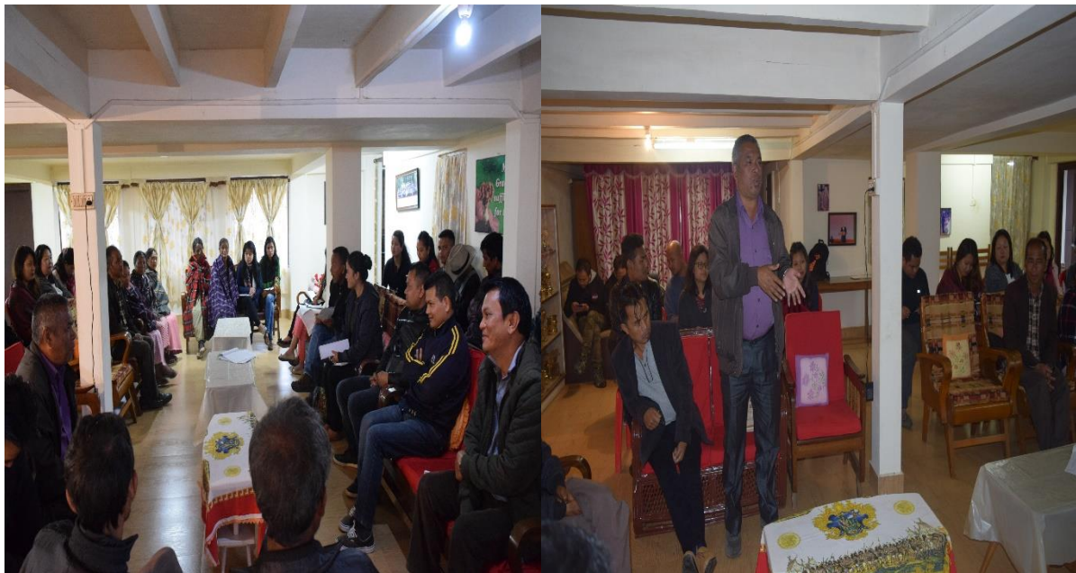
Figure 2 Discussion with Land Owners

The consultation was held on 11th of April, 2018 at Manai in the presence of Mairang Block Development Officer; officials from Public Work Department (Road) and Revenue and Disaster Management Department; Headman's from Manai, Wahlakhaw, Umthied Bynther, Nongbah Bynther, Pyndengumiong, and Lumsokhlur; along with the land owners who were directly affected from the land acquisition. There were 20 participants. (Annexure 2)