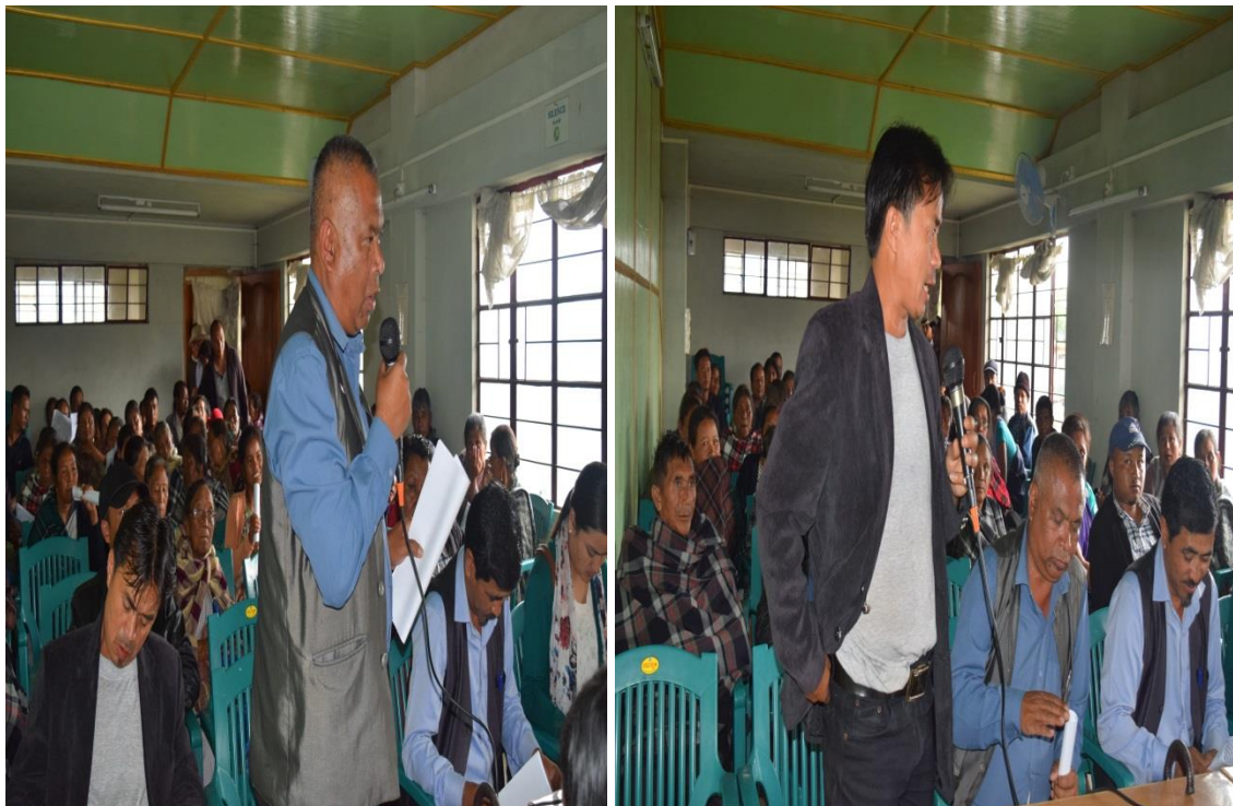
Figure 6 Community participation at the Public Hearing.